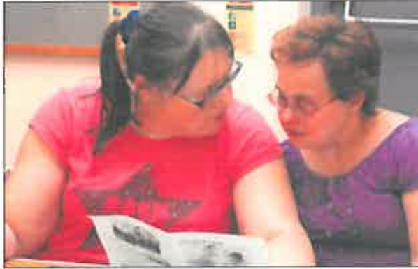
The service can provide information on all matters.