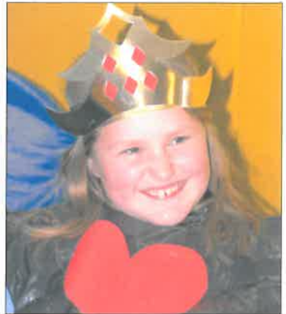
HAPPY DAYS: The Queen of Hearts made quite an impression at a regular Mencap Afterschool Club.