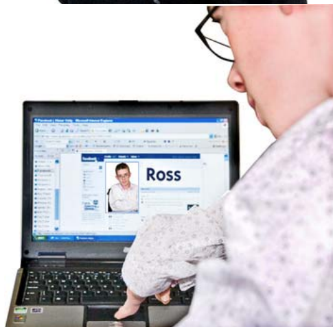
Using the internet